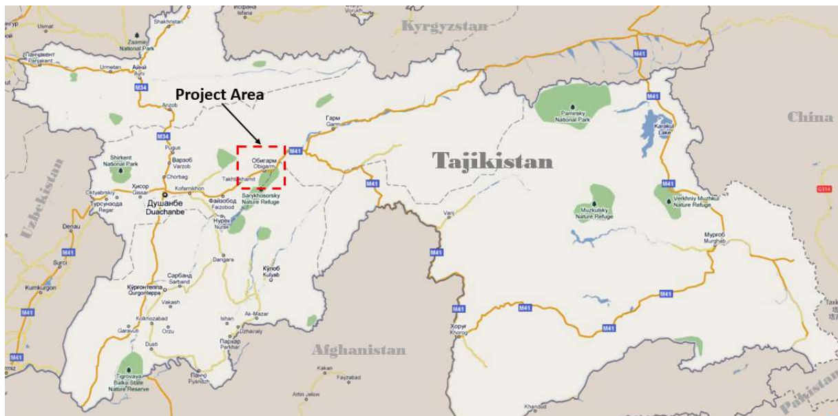
Map 1 - Project Area

Design and Procurement under Package 3 (The Project), applying Output and Performance-based Design and Build (D&B) type of contract, will be conducted in accordance with AIIB’s Procurement Policy and AIIB’s Interim Operational Directive on Procurement Instructions for Recipients, June 2016.